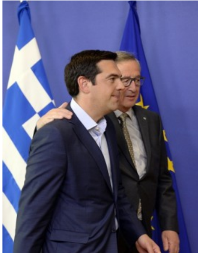
Tsipras, left, with European Commission president Jean-Claude Juncker on Wednesday